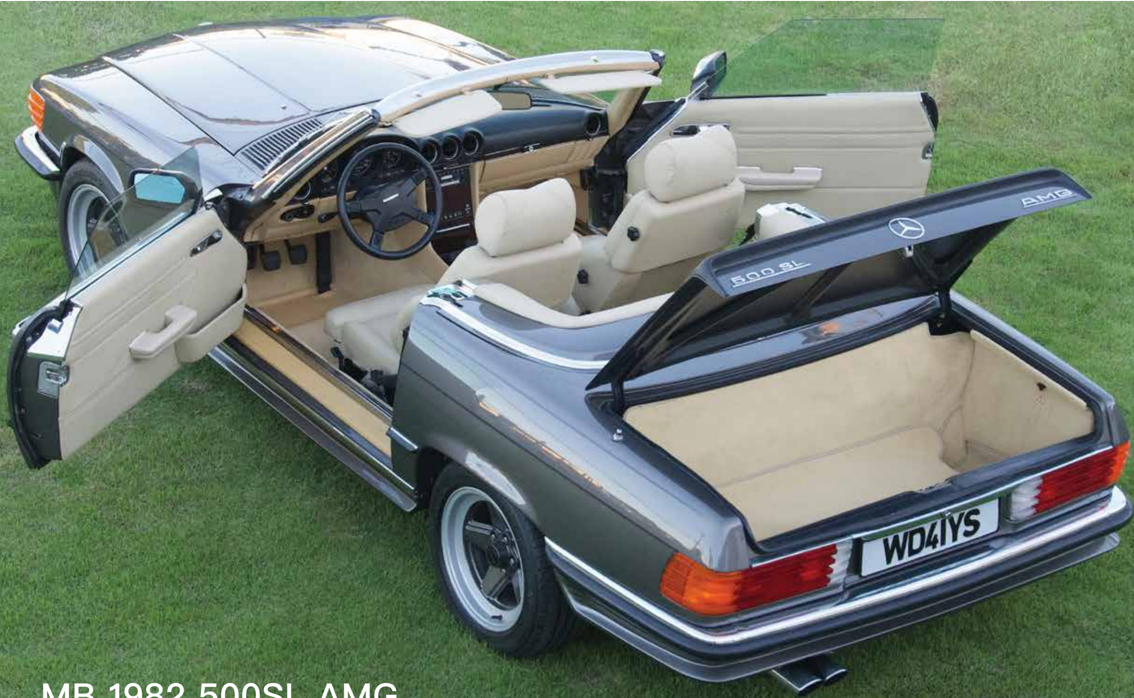
MB 1982 500SL AMG VIN: 10704612001372